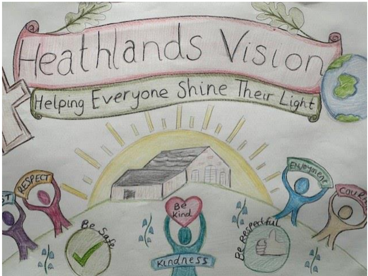
Heathlands Newsletter July 2024