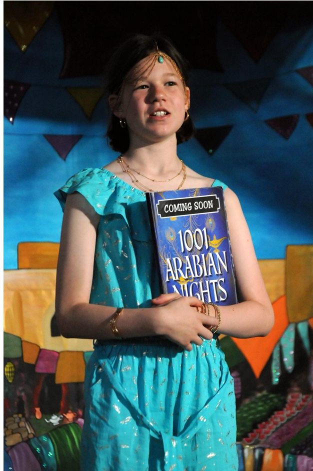
Year 6 Retreat